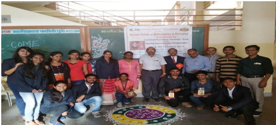
Some teachers and students participants after the Valedictory Function on 9/2/2018 Operations Research Course and Maths Guest lectures photos (2017-18)