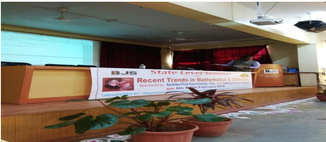
Dr.PrakashDixit(HOD Statistics,ModernCollege,Pune) delivering a lecture on ‘Simulation’ on 8/2/2018